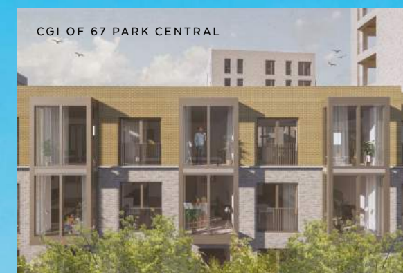
CGI OF 67 PARK CENTRAL

We welcome any feedback from our neighbours and the local community. Pedestrian access to visit the site is via West Parkside, or alternatively feel free to contact a member of the site management team between 8am – 6pm, Monday to Friday.