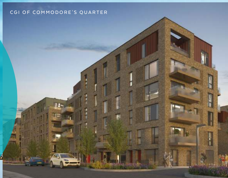
CGI OF COMMODORE'S QUARTER

Meanwhile, the mild January weather helped progress on the construction of the next blocks - the Harbour, Spinnaker and Vanbrugh Apartments. Scaffolds are being removed from two of the blocks, revealing the attractive brick facades.